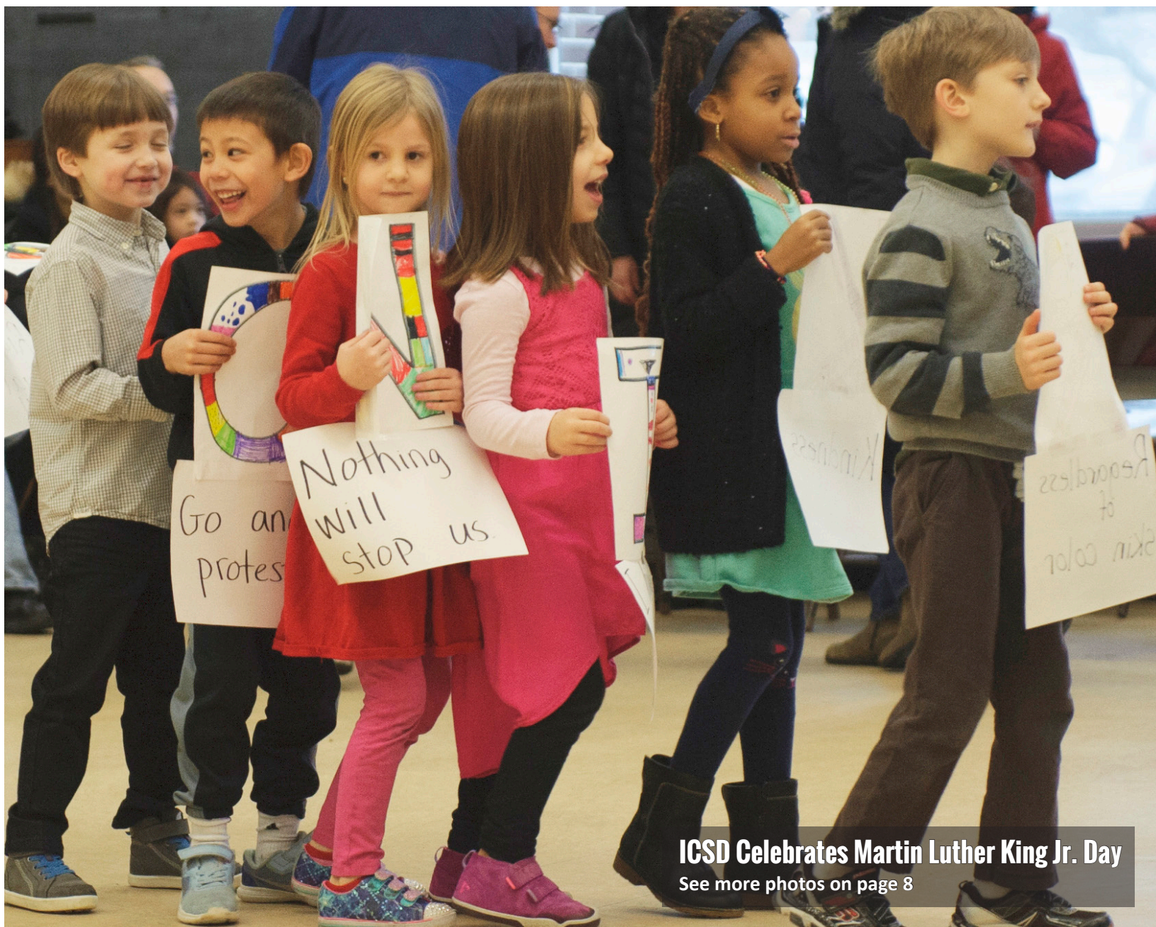
ICSD Celebrates Martin Luther King Jr. Day See more photos on page 8